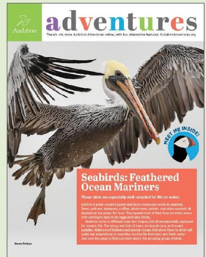
Adaptations are key for birds that survive at sea.