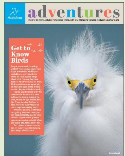
All colors, shapes, and sizes—birds are the wildlife next door.