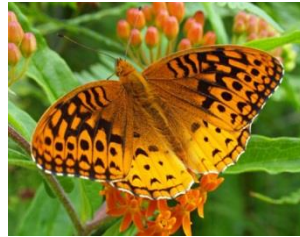
Great Spangled Fritillary