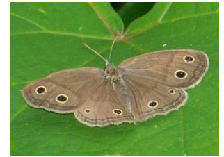
Little Wood Satyr