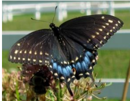
Male - Black Swallowtail - Female