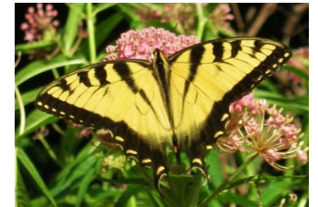
Eastern Tiger Swallowtail