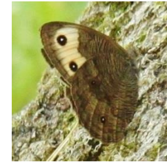
Common Wood Nymph