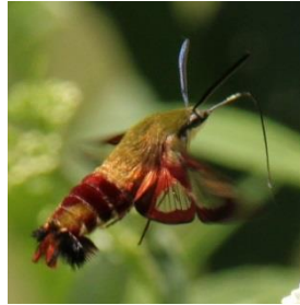
Hummingbird Clearwing Moth