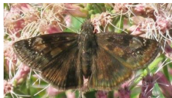
Wild Indigo Duskywing