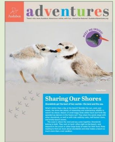
“Sharing Our Shores” student magazine