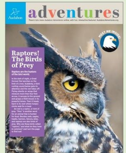
“Raptors! The Birds of Prey” student magazine